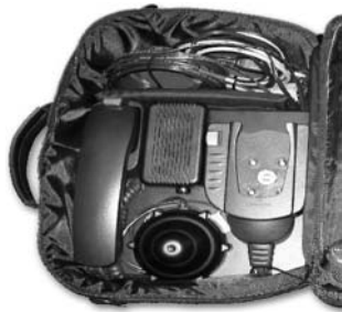
Portable Docking Kit for 1600