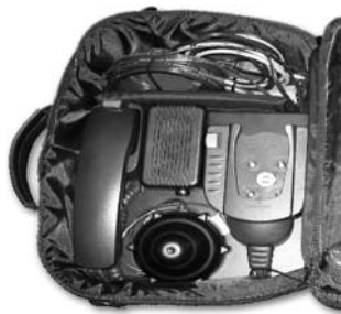
Portable Docking Kit for 1600